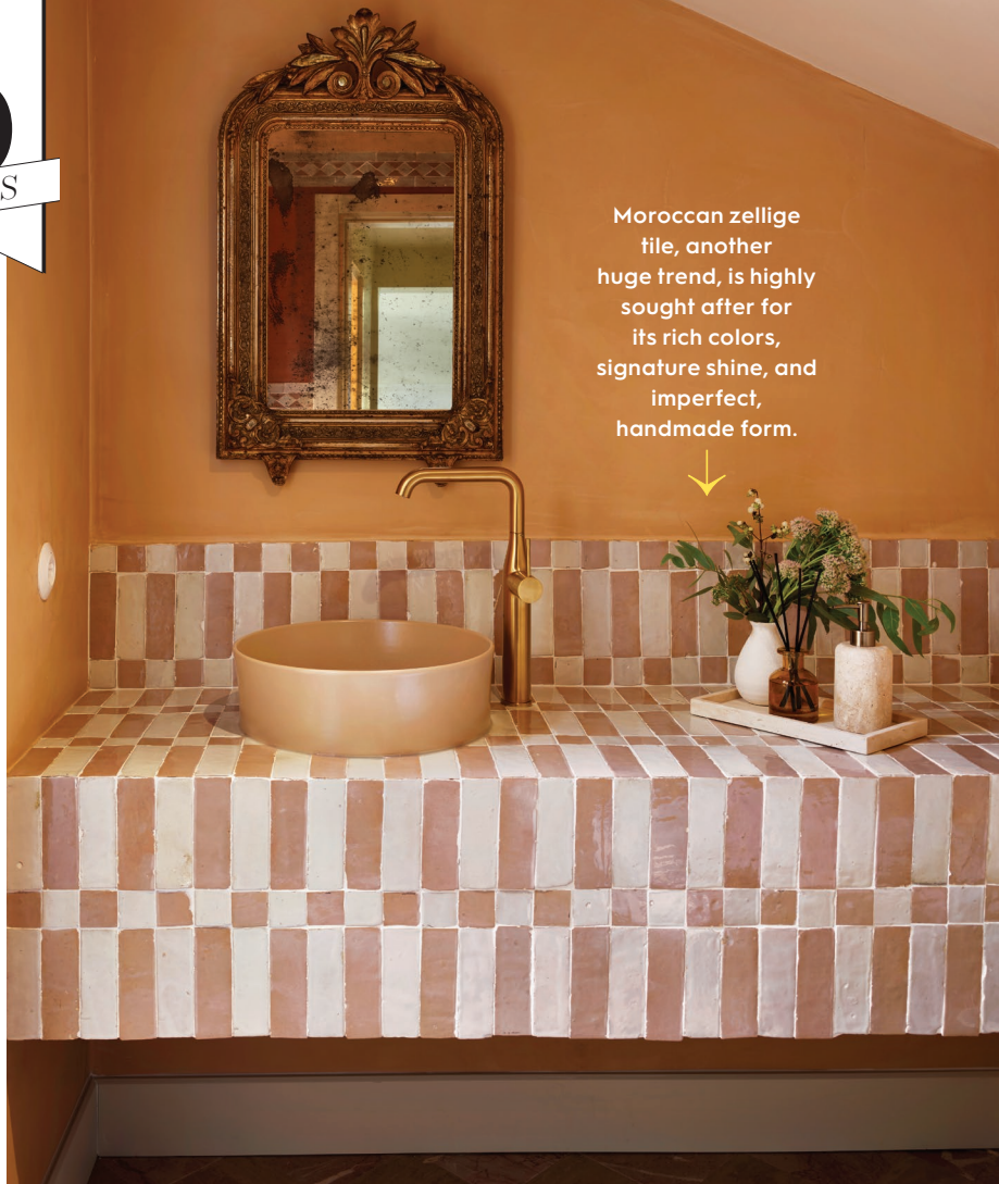
Moroccan zellige tile, another huge trend, is highly sought after for its rich colors, signature shine, and imperfect, handmade form.