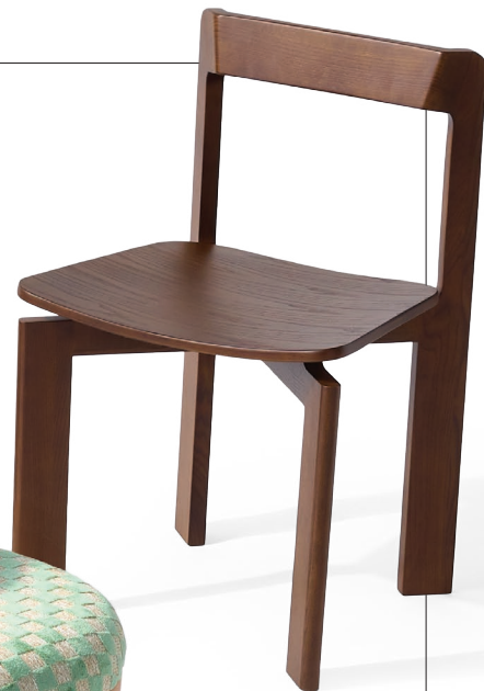
▲ Sometimes less is more, as in this minimalist piece with an angular form. Leola Side Chair, $649 for 2; allmodern.com