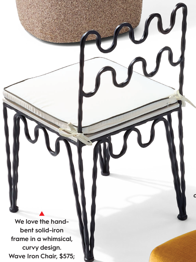
▲ We love the hand-bent solid-iron frame in a whimsical, curvy design. Wave Iron Chair, $575; treehouse.com