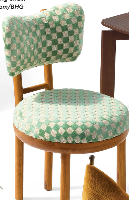
▲ The shape feels a little 1950s; the checkered upholstery is so right now. Jacquard Dining Chair, $398; anthropologie.com