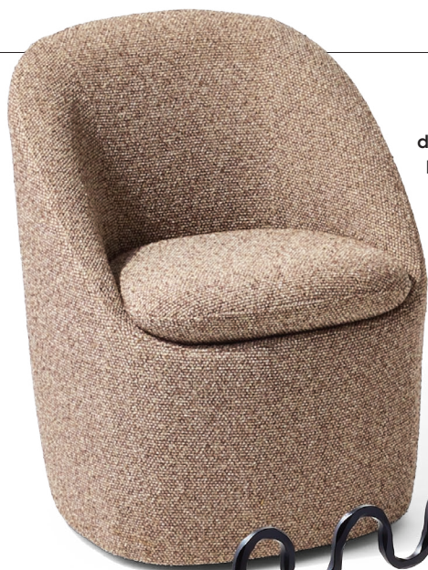
▲ This upholstered barrel silhouette works as a dining or accent chair. Mira Everywhere Dining Chair, $149; walmart.com/BHG