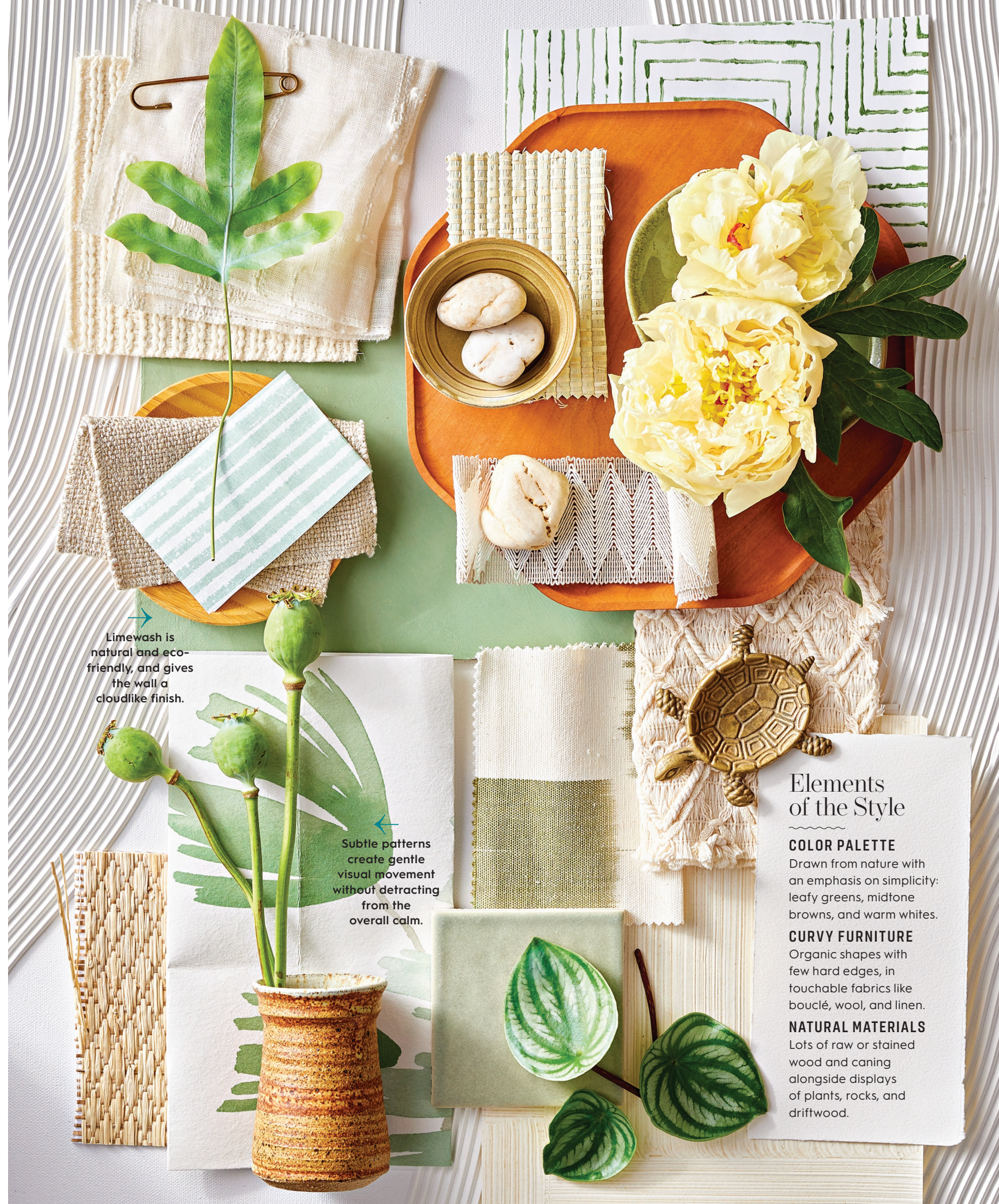
SLAT WALL: THE WOOD VENEER HUB USA, LIMEWASH: JH WALL PAINTS

Limewash is natural and eco-friendly, and gives the wall a cloudlike finish.